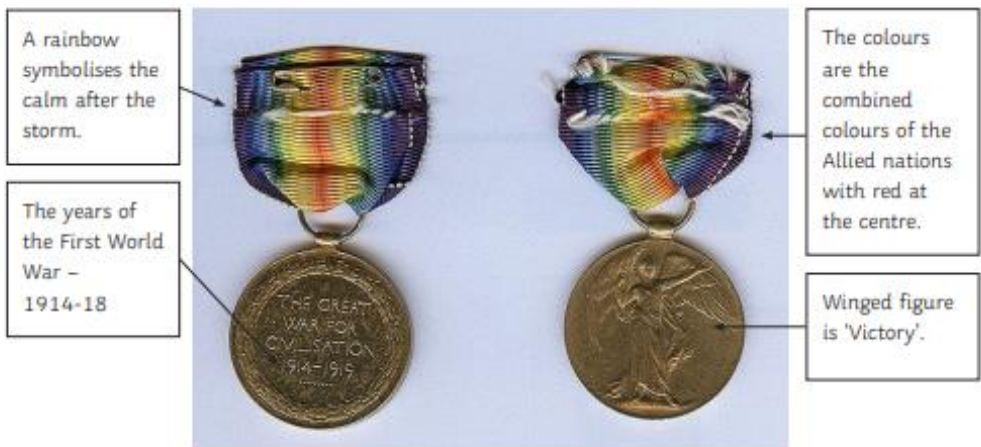
Bronze medal, not too expensive after the war, but long lasting.

This medal celebrated the end of the First World War and was given to soldiers who had fought in active theatres of the war. It was a symbol of great pride but its design was also highly symbolic .