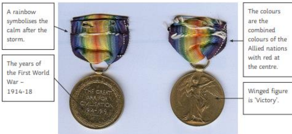
Bronze medal, not too expensive after the war, but long lasting.

This medal celebrated the end of the First World War and was given to soldiers who had fought in active theatres of the war. It was a symbol of great pride but its design was also highly symbolic .