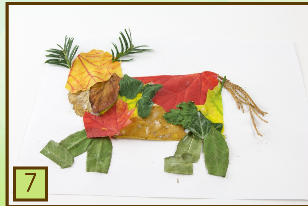
7 Add extra materials to make the ears and tail.