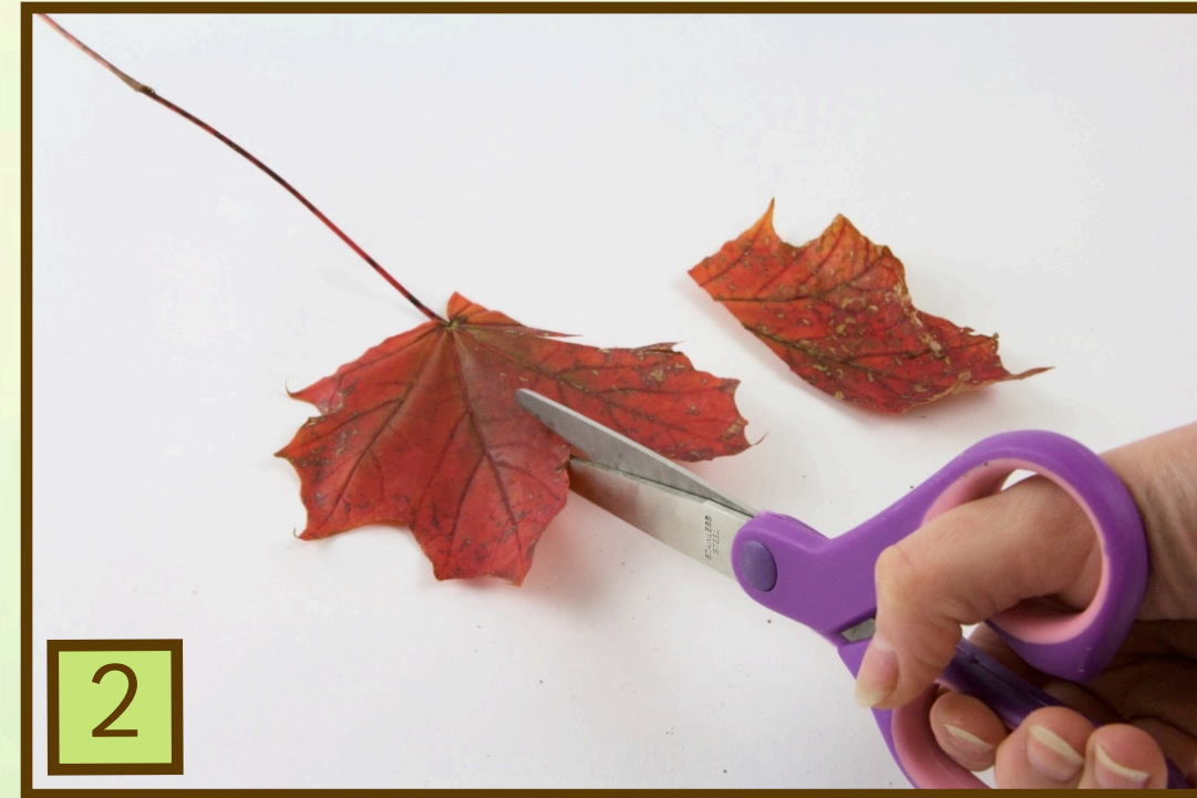
2 Cut leaves to different shapes.