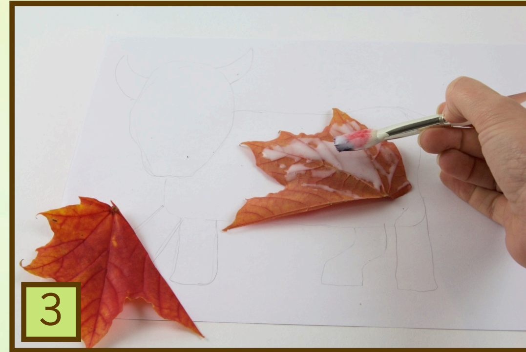
3 Glue the leaves onto your animal outline.