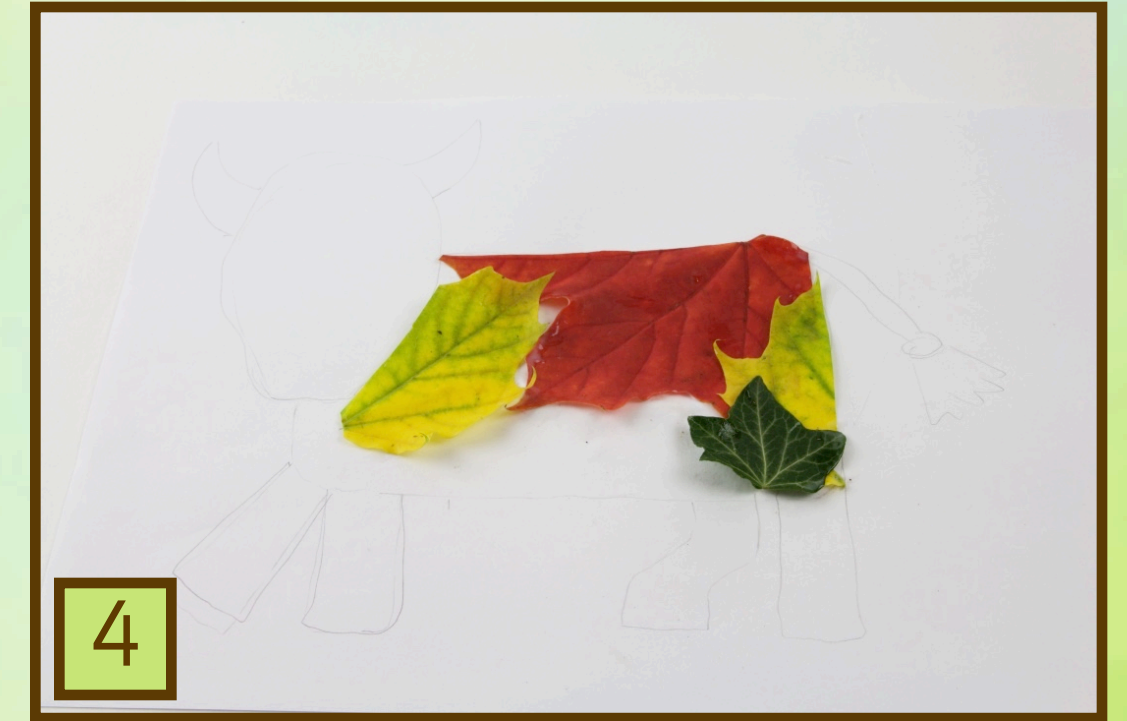
4 Continue cutting and overlapping the leaves.