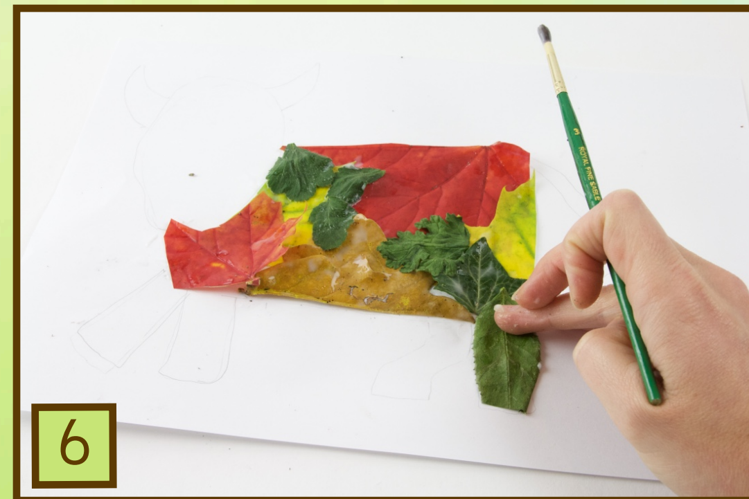
6 Remember to press down firmly to make the leaves stick to the paper.