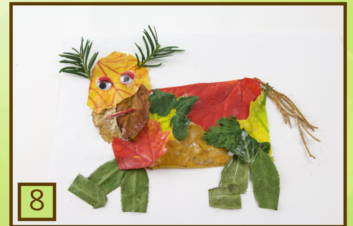
8 Glue some eyes and a mouth to your animal.