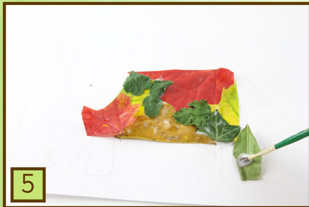
5 Cut and glue longer leaves to make the legs.