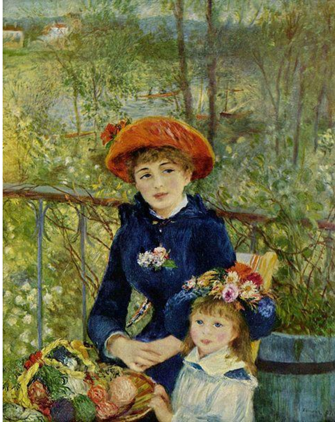
Pierre- Auguste Renoir