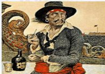
Captain William Kidd