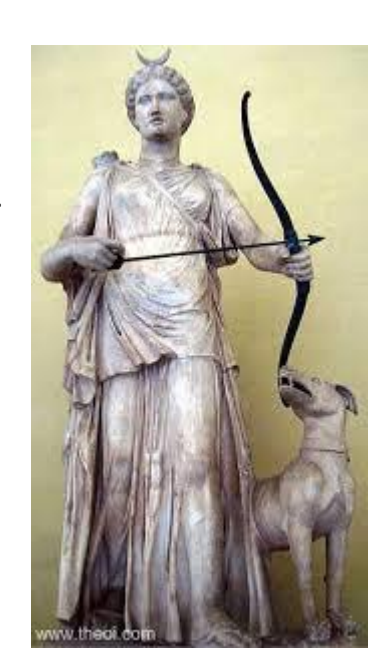
A Greek statue of Artemis

Artemis was a clever and strong goddess who was worshipped by women and who valued nature. She was one of the Twelve gods of Olympus.