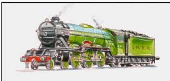
A Victorian steam train

In Victorian times, the steam train was invented which made travel easier for ordinary people. It was cheap and quick. More and more railway lines were laid to different beaches in Britain.