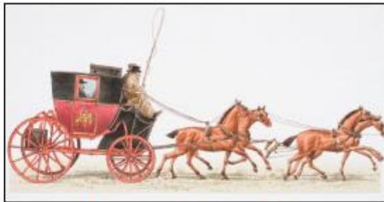
A horse and carriage for a rich family

Going to the seaside used to be something that only rich people could do. They could travel in their expensive carriage and spend a few weeks or even a few months by the sea. Poorer people couldn't do this as they couldn't afford the trip or take the time away from their work as travelling by carriage took a long time.