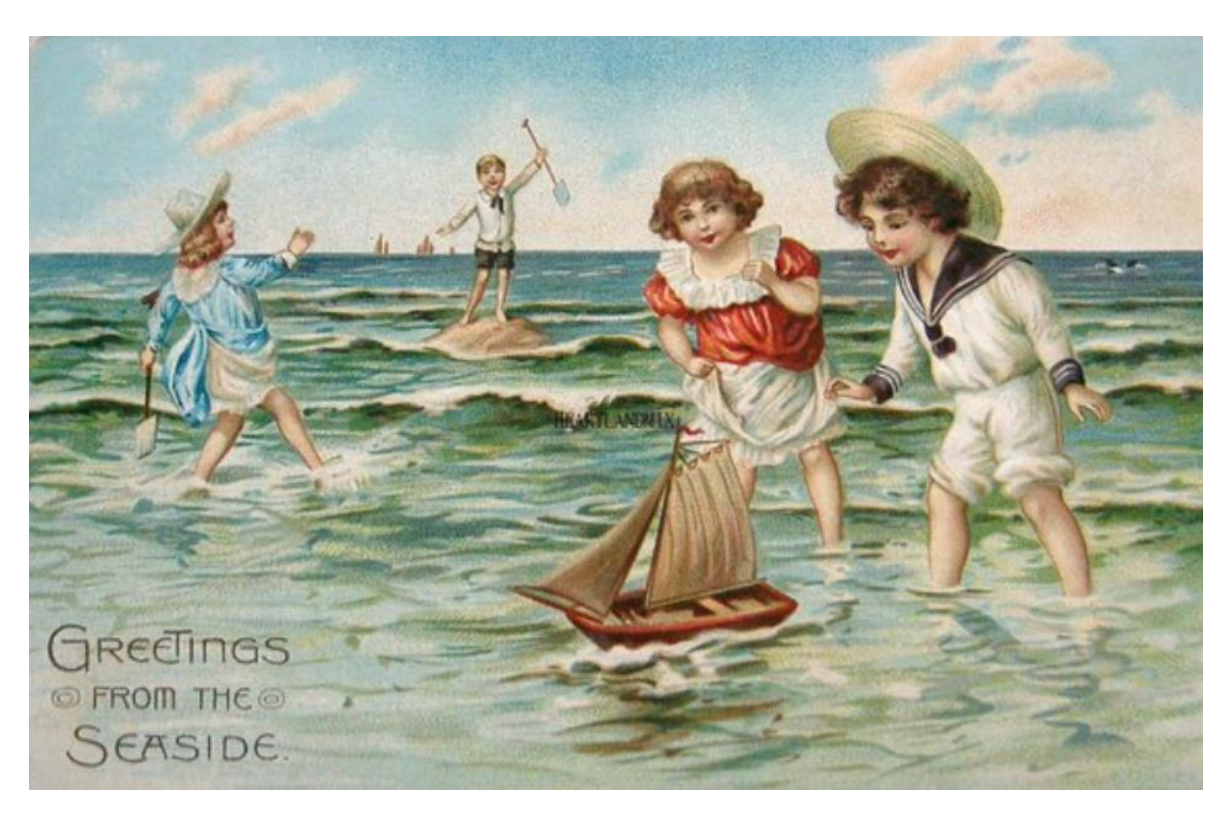
A picture postcard