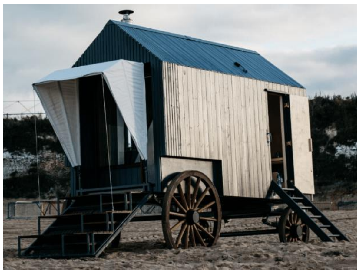
A bathing machine