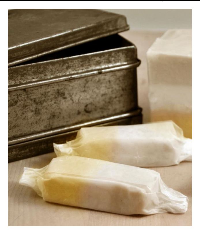
A hokey pokey