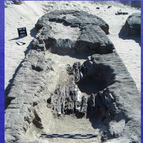
Old canoe found in Egypt