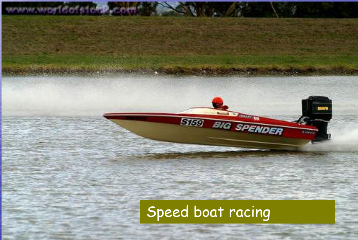
Speed boat racing