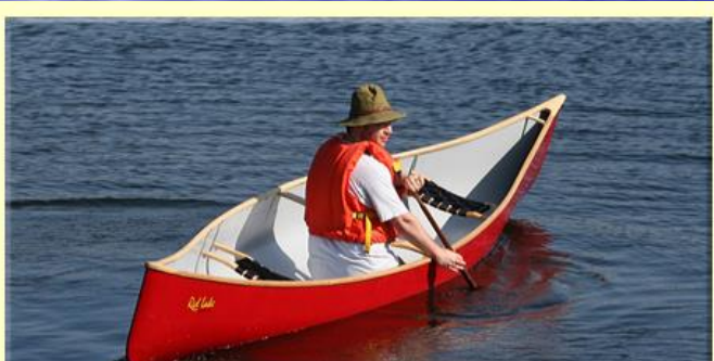
Modern canoes are normally made from types of plastic