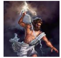
Zeus shown throwing a lightning bolt.

In Ancient Greek religion, people worshipped many different Gods. Zeus was the king of the Greek gods who lived on Mount Olympus. He was the god of the sky and thunder. His symbols include a golden, jagged lightning bolt and a fierce, mighty eagle.